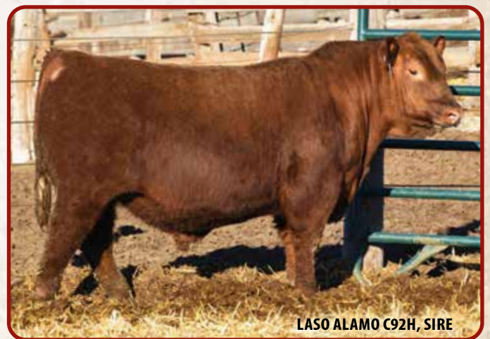
LASO ALAMO C92H, SIRE

Our Lot 2 bull selection is this stylish Alamo son with an impeccable record including a 15.9 REA / ratio 119 and a 3.54 IMF / ratio 113 ultrasound scan. Dam 8189 is a square made, deep bodied, moderate female that goes back to one of our Foundation females. KDM2C Alamo touts a 714 lb WW/ ratio 107 and a 1209 lb. YW / ratio 111! He still does it all with calving ease (16 CED & -2.9 BW) and a great set of balanced EPDs.