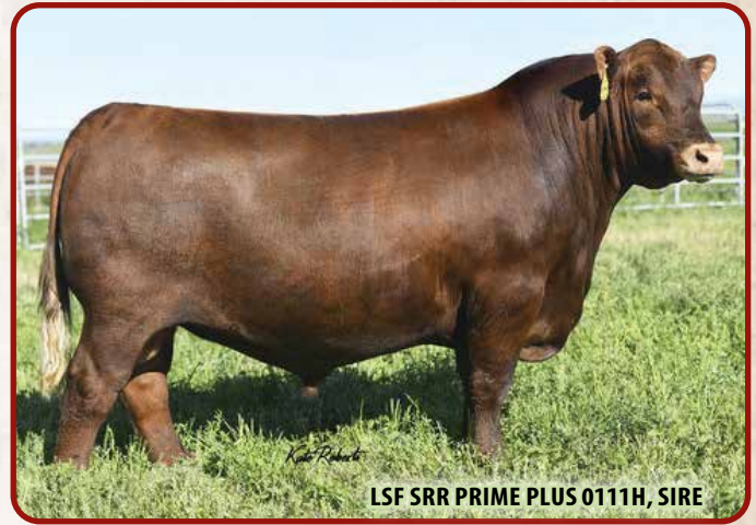
LSF SRR PRIME PLUS 0111H, SIRE

Prime Plus son excelling with a 114 WW ratio and a 40.5 cm scrotal measurement. His dam is a top Ribeye daughter with a 104 MPPA and a 361 Calving Interval.