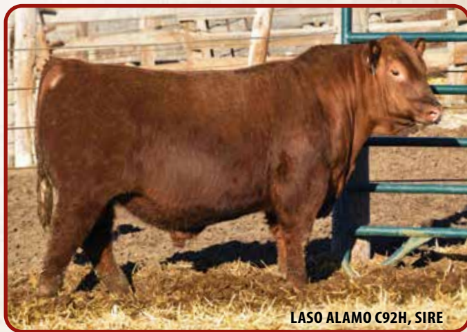
LASO ALAMO C92H, SIRE

We sampled Alamo as a yearling and have been very well pleased with the results. L531 offers top growth & carcass traits and is backed by a Brown Premier dam that records a 103 MPPA on 7 calves and a 366 day Calving Interval.