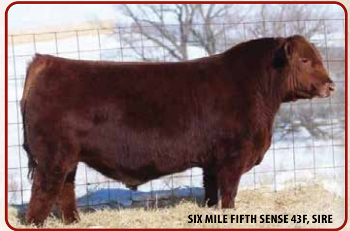
SIX MILE FIFTH SENSE 43F, SIRE

KDM2C Fifth Sense L216 is a bull that stood out early with style, width and dimension like his dam. Dam is deep body broody female. KDM2C Detour F807 has a 358 day calving interval. KDM2C Fifth Sense has the making of an all round herd bull.