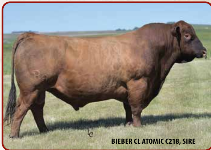
BIEBER CL ATOMIC C218, SIRE