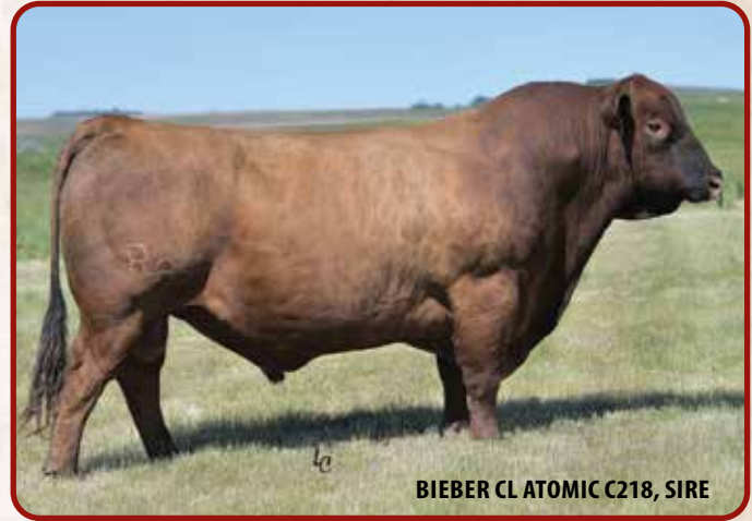
BIEBER CL ATOMIC C218, SIRE

This bull would be a great prospect to use on heifers with his Atomic X Night Focus heritage. His dam was a first calf heifer achieving an MPPA of 102 on her first attempt.