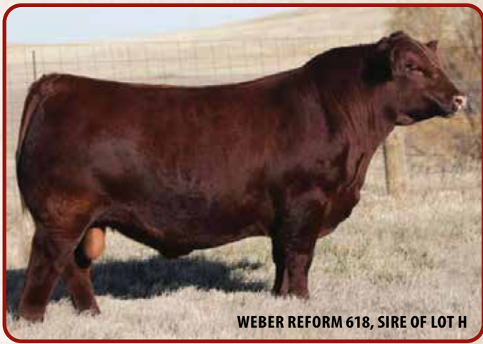
WEBER REFORM 618, SIRE OF LOT H

We purchased WEBR Reform to add growth, performance, length and bone to the cows we have. 85H has great disposition after the first two years on pasture. Works great on moderate frame females and cows with high calving ease EPDs.