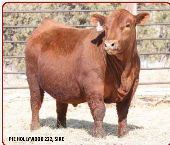
PIE HOLLYWOOD 222, SIRE

Offering 1 straw of semen on the $400,000 most talked about bull in the Red Angus breed this past season. Take your IVF program to the next level with this purchase!