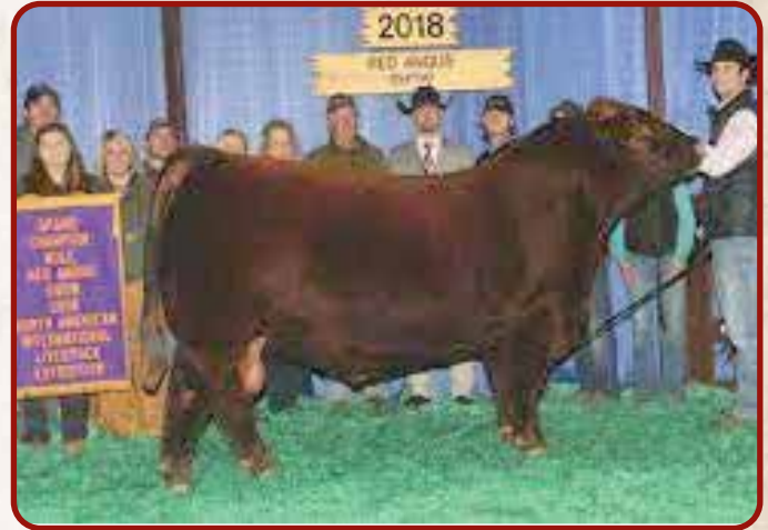
DAMAR MIMI E381, SIRE

We purchased the Windsong cow in the 2013 MO Show-Me-Reds Auction at $14,000 and made her one of our top Donors the following years. She was a highly fertile and large framed cow with a super udder. Damar Mimi is a past National Champion Bull adding extra style but with a lot of performance. Selling 4 embryos with the guarantee of 1 pregnancy if implanted by a Certified ET Tech.