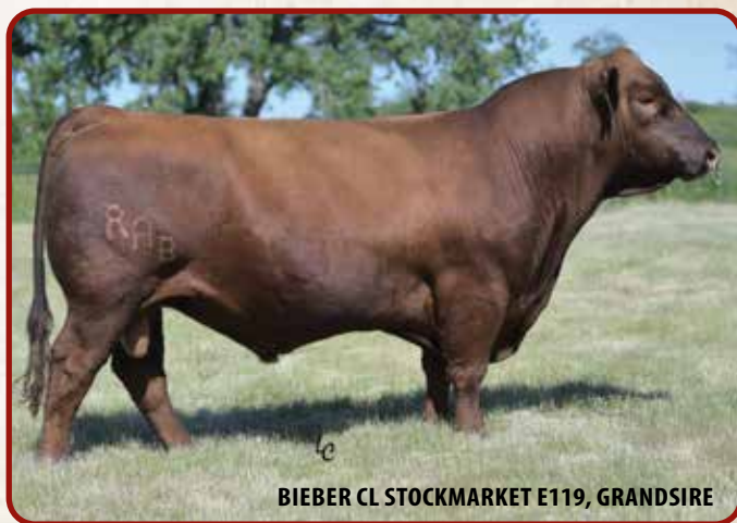
BIEBER CL STOCKMARKET E119, GRANDSIRE

Calving ease bull with unique look and edge since birth. Has growth and performance from Stockmarket #119 and from proven genetic line maternal/bloodlines. Genline dam and grandam have produced growth type progeny. High Pro S, HB and GM scores.