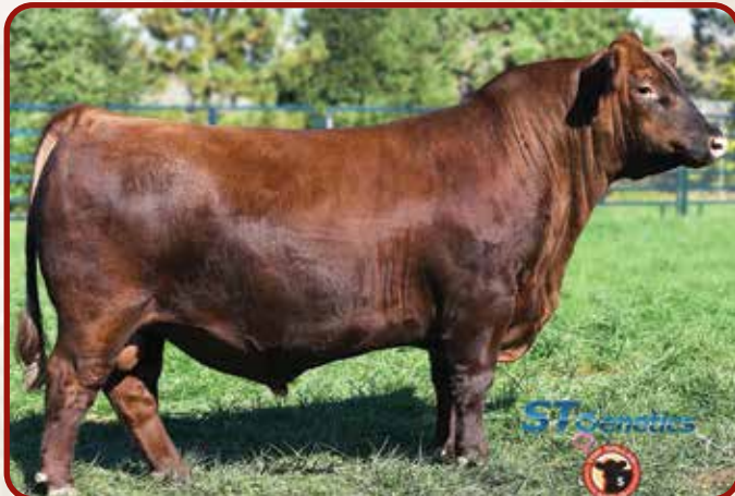
STRA RELENTLESS, SIRE

Top 2% ProS & HB another incredible dam with a tight 362 day Calving Interval and a 101 MPPA.