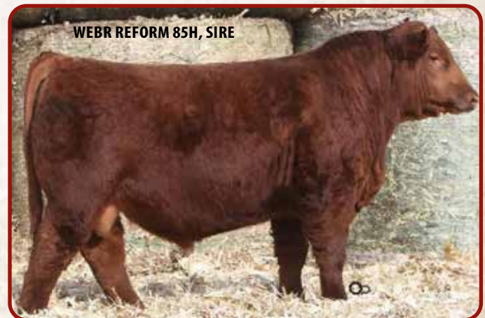
WEBER REFORM 85H, SIRE

WDRR Reformation is WEBER Reform 85H son with lots of style, look like his sire. He also displays great disposition like 85H. Dam has produced maternal brothers with growth and performance. She has 356 day interval on 6 calves.