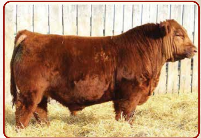
RED MRLA RESOURCE 137E, SIRE

Check out this pedigree combination of a top Stockmarket daughter mated to Resource. Her first calf sold to Swank Farms (a Night Focus son) and is one of the main herd bulls in their Pennsylvania Red Angus program. If you like power and substance, these embryos are for you! Selling 3 embryos with the guarantee of 1 pregnancy if implanted by a Certified ET Tech.