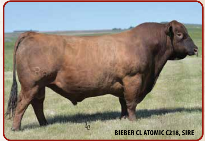
BIEBER CL ATOMIC C218, SIRE

An Atomic X Declaration son that would work on heifers. His dam was a first calf heifer that did everything right with a 76 lb. BW and a 642 lb. WW to earn a 104 MPPA.