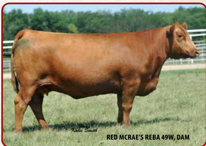
RED MCRAE'S REBA 49W, DAM

One of the first Resolution sons to sell and from the Brylor Ranch's famed Reba 49W cow. This bull offers complete outcross to any other bulls we have offered in the Red Reckoning Auctions of the past. Don't miss his 721 lb. WW and 1218 lb. YW – lots of growth in this rascal.