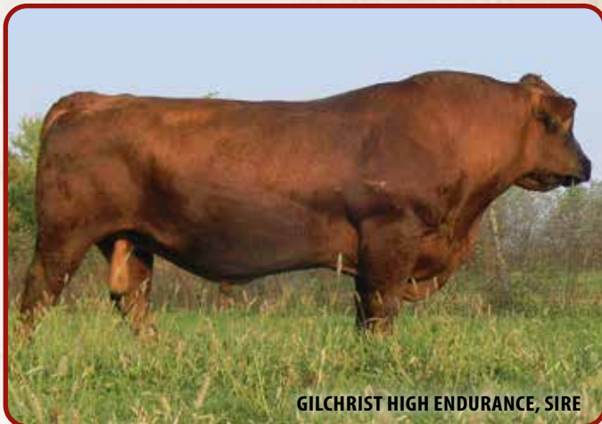
GILCHRIST HIGH ENDURANCE, SIRE

High Endurance was the 2017 Red Alliance $27,500 sale topper and has proven to not only stand the test of time but excel for growth, style and carcass quality year after year. L546's dam is a prime 8 year old with a 361 day Calving Interval.