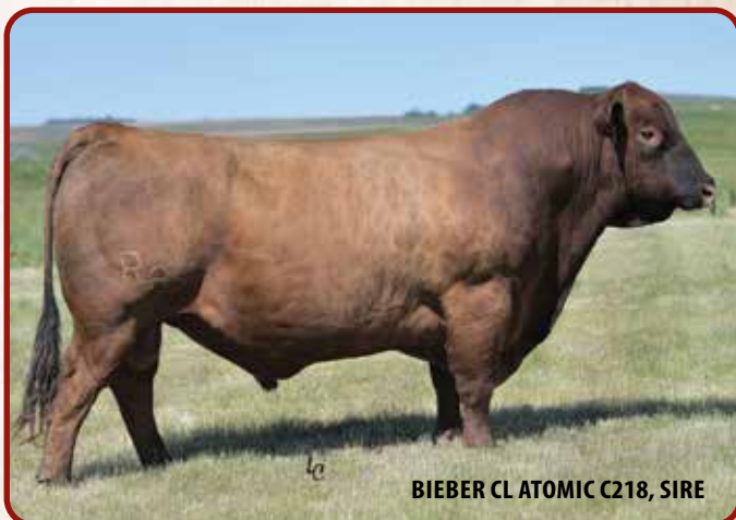
BIEBER CL ATOMIC C218, SIRE

Good choice for calving ease bull or all around herd bull. Dam has a 359 day calving interval on 8 calves. Dam continues to be top producing female in our herd. A maternal sister G841 raised a top open heifer for us last year. Atomic sire for great females, top calving ease EPDS, but still high growth and Grid master EPDS.