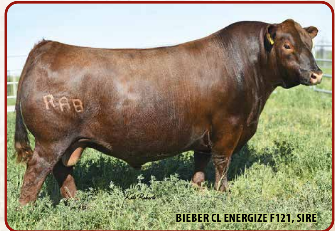
BIEBER CL ENGERGIZE F121, SIRE

L550 is a top heifer bull prospect in this offering. Energize X Checotah pedigree offers new bloodlines to the Red Reckoning program.