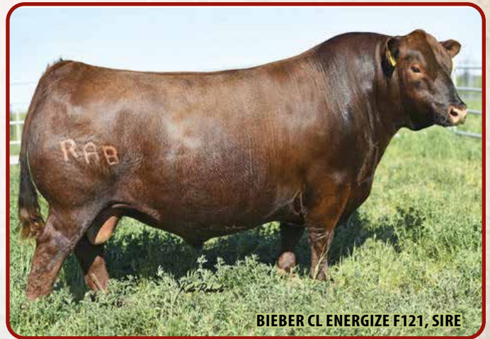
BIEBER CL ENERGIZE F121, SIRE

An Energize son posting a 630 lb. WW to ratio 108. His Gold Mine dam is a solid member of the KFRA herd with 104 MPPA and a 357 day Calving Interval.