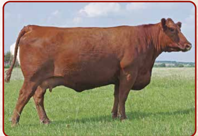
HARMONYS WINDSONG 111, DAM OF LOTS 400 & 403

We produced these embryos when we were a part of the Red Alliance Auctions in Oklahoma and Texas. Recently we sold daughters in the Mississippi Fall Classic Sale where they were very well accepted. Masterpiece is a Santa Gertrudis bull and these F1 Red Angus embryos will produce excellent progeny for the southern climates – get on DVAuction and buy these! Selling 3 or 6 embryos with the guarantee of 1 embryo for each pkg of 3 if implanted by a Certified ET Tech.