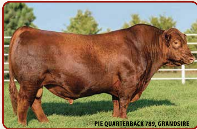
PIE QUARTERBACK 789, GRANDSIRE

What would you expect from a Quarterback X Stockmarket pedigree bull? How about a critter with a 606 lb. WW, 1232 lb. YW and top 5% MARB EPD. Check this bull out sale day – he would have been in the front 10 Lots in most sales in the country.