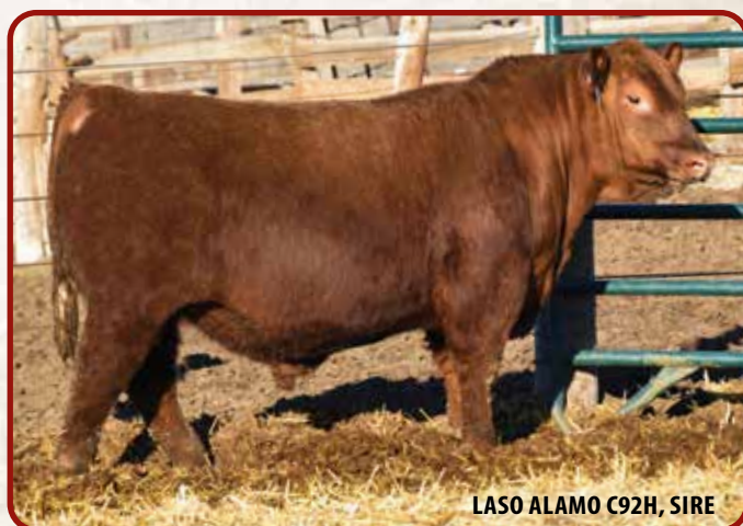
LASO ALAMO C92H, SIRE

These Alamo sons have certainly not disappointed our group and this bull will not disappoint you when you see him in the bullpen. His dam comes from the highly maternal Mulberry bloodline and offers a 365 Calving Interval on 7 natural calves.