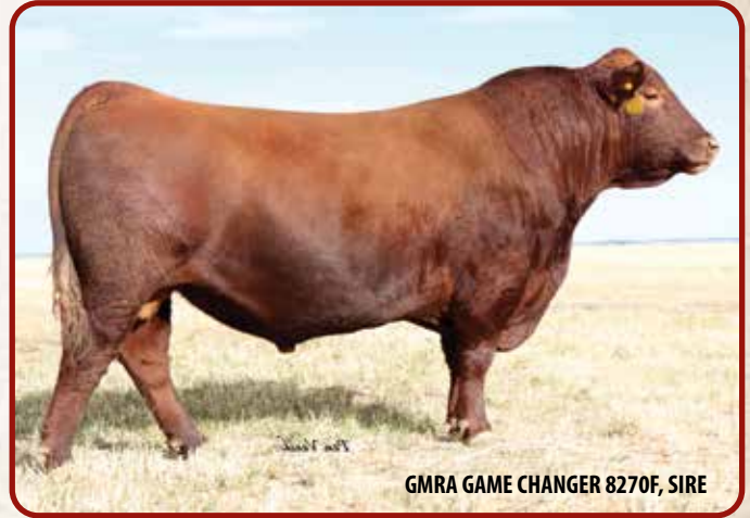
GMRA GAME CHANGER 8270F, SIRE

We can't say enough about these Game Changer sons! Check this bull out with a 733 lb. WW / 125 ratio and from a top Domain daughter with a 107 MPPA and a 362 Calving Interval.