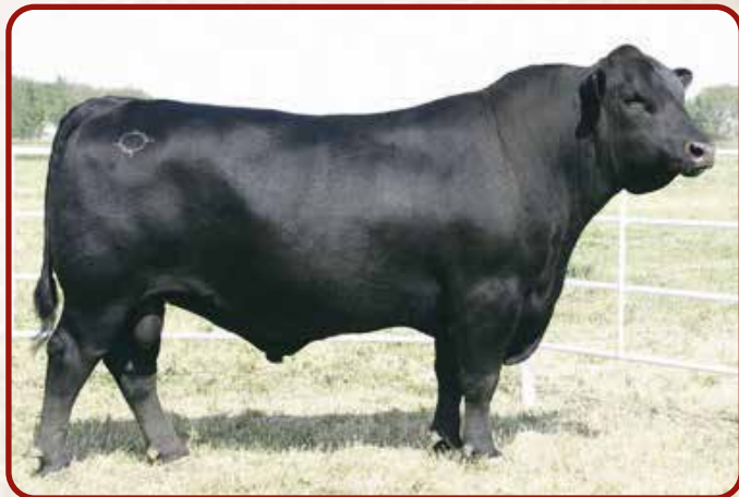
MYTTY IN FOCUS, PATERNAL GREAT GRANDSIRE

3SCC Laser Focused C171 is undoubtedly the most influential herd sire ever used in the Koedam Cattle Co. program with his amazing EPDs of top 1% ProS & STAY; top 2% HB, CED & HPG and top 7% GM, ADG & MARB! The 2023 Red Reckoning will highlight 2 sons including this bull and Lot 35. K121's dam was purchased in the 2017 Leddy Dispersal as an open heifer and now posts an 111 MPPA on 4 calves with a 356 day Calving Interval – great bulls can be found throughout this offering – don't miss this one!