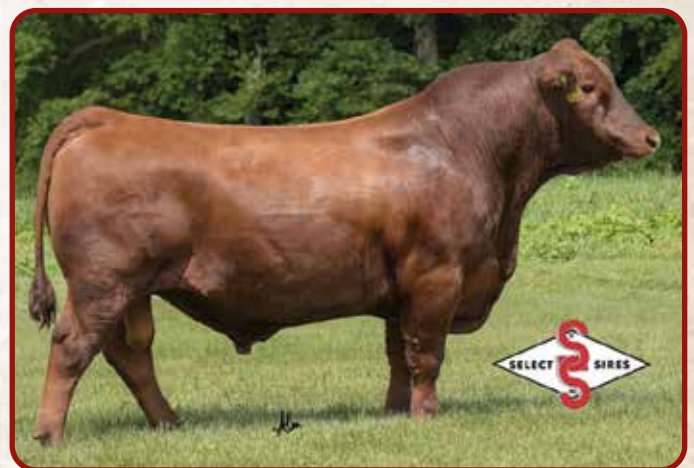
HXC GRINDSTONE 9908G, SIRE

K56 is the Grand Finale of the 2023 Red Reckoning Sale and offers 79 lb. BW and a 13.2 REA. With this being the 50th Year of Red Angus Production for the Star G Ranch, we have had many events over the years but none have been as rewarding as meeting fellow cattlemen at our own sale facility. This final bull carries the theme of Kemen Farms, Koedam Cattle Co. and the Star G Ranch with a dam that records a dependable 102 MPPA with a 366 day Calving Interval on six calves. Thank you for coming to our auction or tuning in via DVAuction on the internet. We value you as a customer and want to help you market your future Red Angus females. -- The Red Reckoning Team.