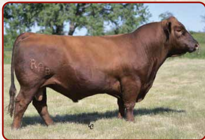
BIBER CL STOCKMARKET E119, SIRE

Stockmarket Alert! One of the most influential and dominant bulls in the Red Angus breed today is the astounding Bieber CL Stockmarket E119 stud that is siring top-selling and more importantly top performing sons and daughters from multiple angles in the beef business. If you have not yet implemented Stockmarket bloodlines in your beef operation, you had better take a look at Lots 1, 5 and 21 in this year's Red Reckoning. If you want to infuse some carcass quality into your next calf crop, don't overlook Lot 21's 4.51 IMF scan to 150 ratio!