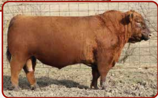
LORENZEN GLADIATOR E800, SIRE

There are 2 Lorenzen Gladiator E800 sons in this offering (Lot 7 & 34) and both exhibit EXTREME muscle composition and thickness. Lorenzen Gladiator E800 comes from the same cow family that produced Gilchrist High Endurance (sire of G. Royal Peacock) and was the high-selling bull in the 2018 Lorenzen / VF Red Angus Bull Sale in California. If you like the "clubby calf look", be sure and check out both of these Gladiator sons at the Star G Ranch loaded with meat and muscle.