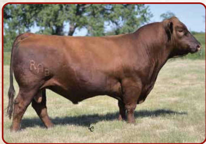
BIEBER CL STOCKMARKET E119, SIRE

Lot 4 is one of 2 Bieber Atomic sons in this auction and closely follows the pattern of Lot 3 with a dependable, highly-productive dam that offers longevity and a reason to buy her son. K115's dam is a bigger framed, well made, super uddered cow with a 106 MPPA and a 368 day Calving Interval on 5 calves! If you sell calves by the pound at weaning time, don't overlook this powerhouse, posting a 737 lb. WW to ratio 106! All of the Red Reckoning bulls have already passed a fertility check and are ready to go service cows the minute you get them home.