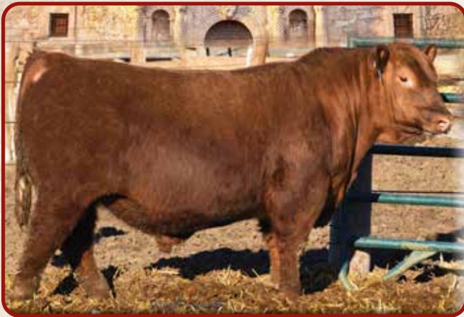
LASO ALAMO C29H, SIRE