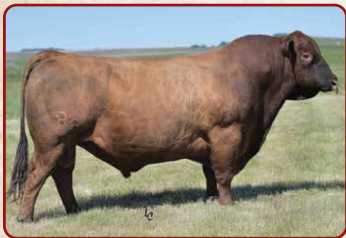
BIEBER CL ATOMIC C218, SIRE