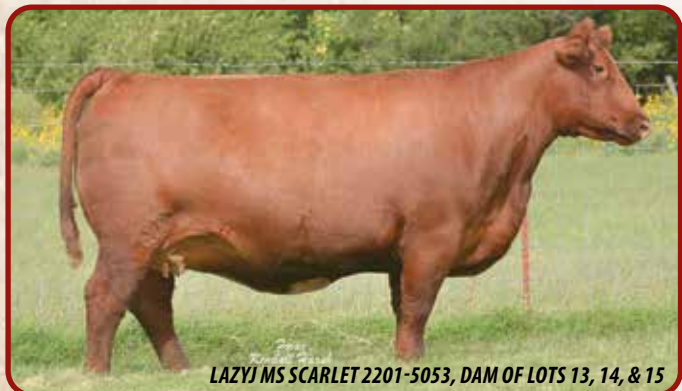
LAZYJ MS SCARLET 2201-5053, DAM OF LOTS 13, 14, & 15

We mated Lazy J Ms Scarlet 2201-5053 on multiple flushes to Independence and when you see Lot 14, it will be apparent why. His flushmate sisters are still being utilized in the Star G Ranch herd and are solid members of the tribe. If you like dependable genetics that have stood the test of time, invest in Gilchrist Self Employed 109J.