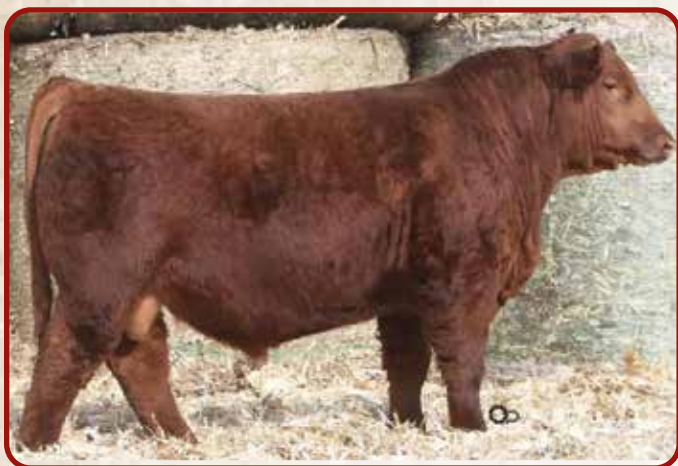
WEBR REFORM 85H, SIRE OF LOTS 45-48