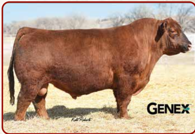
3SCC DOMAIN A163, SIRE

K46 offers a dependable combination of genetics combining Domain with a Tommy Jack daughter. If you want to improve carcass quality in your future calf crops, buy this bull with a 108 ratio IMF and a 13+ REA. His sire 3SCC Domain A163 has been one of the most widely used bulls in the breed, recording 4,945 progeny as of this catalog printing.