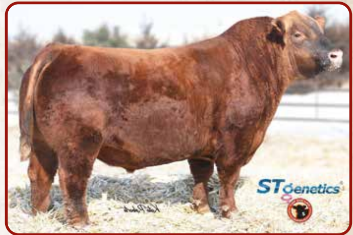
PIE JUST RIGHT 540, SIRE

Lot 25 is a son of the STGenetics stud bull – PIE Just Right 540 and a 103 MPPA Fusion daughter with a 369 Calving Interval on 5 calves. This is the halfway point of our Top 50 Bull Offering and this February bull is as complete as any in the auction with a 13.9 REA to ratio 106 and 3.13 IMF to ratio 104.