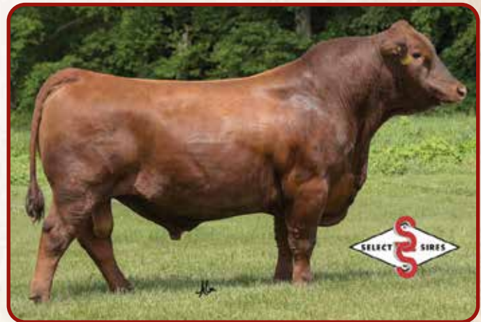
HXC GRINDSTONE 9908G, SIRE

The LLRA division of the Kemen Farms Red Angus program was responsible for the high-selling $14,500 bull – LLRA Limit Up H29 – that sold in the 2021 Red Reckoning Sale to Stonsgard Cattle Co. – Minnesota and the Star G Ranch – Iowa. This Grindstone son offers great length of body and style coming from a Jeffries Checotah dam.