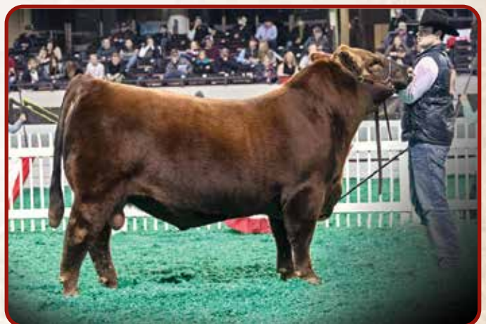
DAMAR MIMI E381, SIRE

106J is a son of a past Star G Ranch Donor Cow – Harmonys Windsong 111 that has 57 registered progeny to date. 106J's sire was the 2019 NWSS Grand Champion Bull where for the first time in history full siblings were National Champions (Andras Fusion X DAMAR Mimi W085) as his sister was Grand Champion Female that same day in Denver. He expresses an extremely long body with a little extra frame – you won't have trouble finding him in the sale pen.