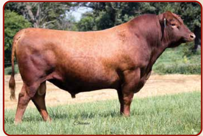
LSF RHO NIGHT FOCUS 76B, SIRE

You will appreciate the stats on this Night Focus son with a BW 79 lb.; WW 712 lb. and YW 1111 lb., a top 3% ProS and 6% GM. His dam was a first calf heifer that "hit it out of the park", weaning this 119 ratio bull to attain a 108 MPPA on her first try. Who knows what the future holds but this bull from a top young cow could end up being one of the breeds greatest – investments like this could pay off big time!