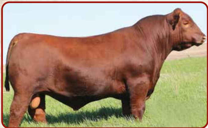
PIE UP FRONT 508, SIRE