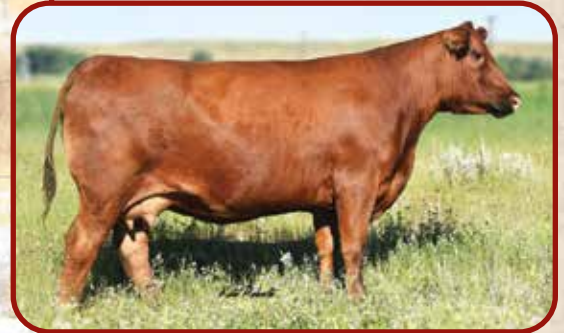
TBJR MISS SENSATION 407, DAM