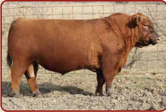
LORENZEN GLADIATOR E800, SIRE