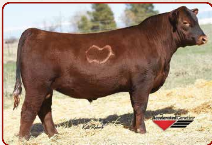
SCHULER SUPREMACY 7177E, SIRE

We have constantly referenced the females behind this great pen of bulls and Lot 42 comes from yet another outstanding Red Angus female. His dam was a first calf heifer that cranked out this 717 lb. WW, 1171 lb. YW bull with a 13.54 REA scan to attain a 106 MPPA!