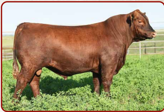
LSF SRR GRAND PRAIRIE 7039E, SIRE

An ET flushmate brother to Lot 13 and another that stands out with power, looks and performance traits. He will add pounds to your future calf crops, coming from the famed Donor Matron – Lazy J Ms Scarlet 2201-5053, a Mulberry daughter with exceptional body mass, udder structure and lots of milk production. If you have a lot of cows to breed and want consistency in your future calf crop, buy these flushmate brothers from one of the Red Angus breed leading events in the country – The Red Reckoning Sale.