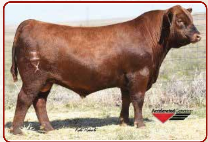
HXC DAWSON 7003E, SIRE

This Dawson son comes from some old-time foundation genetics in a Cheyenne B221L daughter with a 102 MPPA on six calves. We are 38 lots deep in this astounding pen of Red Angus bulls and still offering a 13.7 REA to ratio 105. Both of the Dawson bulls deserve your attention on sale day – his brother sells as Lot 8.