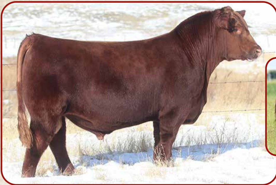
SIX MILE PARABELLUM 675G, SIRE