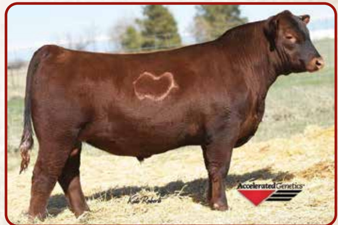
SCHULER SUPREMACY 7177E, SIRE

K119 is another of the top 50 bulls that come from a dependable and profitmaking cow with a 105 MPPA and 369 day Calving Interval. Last year's Supremacy sons were well received and this long bodied son offers an outcross pedigree on the dam's side with Paringa Iron Ore.