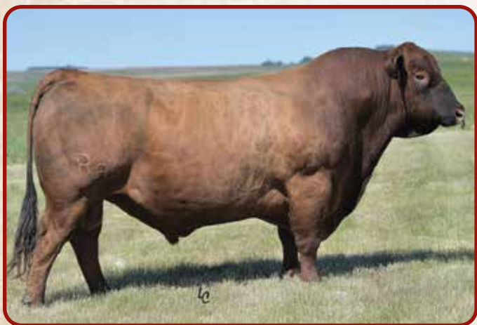
BIEBER CL ATOMIC C218, SIRE

This is truly a remarkable pen of bulls for the 2023 Red Reckoning Sale and Lot 40 continues the trend of rock-solid females backing them. His dam has a 102 MPPA with a 360 day Calving Interval on 7 head of progeny. His sire has an impressive record as well with a 84 lb. BW, 723 lb. WW, 1346 lb. YW, IMF ratio 111 and REA scan 15.41 to ratio 110!