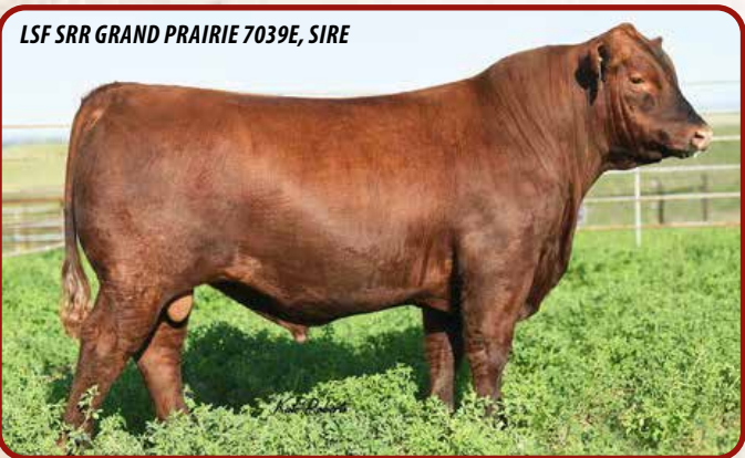
LSF SRR GRAND PRAIRIE 7039E, SIRE

Lot 12 is the first of the LSF SRR Fantastic 9206G sons that will be unveiled in this auction. We purchased this Calving Ease Herd Bull with Kemen Farms Red Angus and share him with fall breeding at Star G Ranch and spring breeding at Kemen's in Minnesota. He is proving to be a true calving ease bull with great performance and scan data. 148J's dam was a purchase from Green Mountain Red Angus of Montana and stems from their famed Mesa Maid cow family.