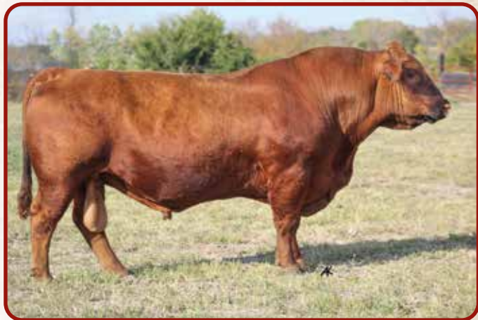
GILCHRIST HIGH ENDURANCE, SIRE