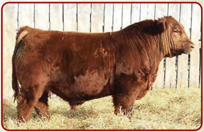
RED MRLA RESOURCE 137E, SIRE

This Resource son will catch your attention when you enter the bull pen – he is square, stout made and loaded with meat and muscle. The cow power behind the Red Reckoning Bulls cannot be overlooked – K116's dam is an amazing 11 year old cow that touts a 105 MPPA and more incredibly a 365 day Calving Interval on 9 calves! Longevity is one of the highest returns and profit-making traits in a cow herd. Invest in this bull with confidence that he will sire top-notch calves for years to come.