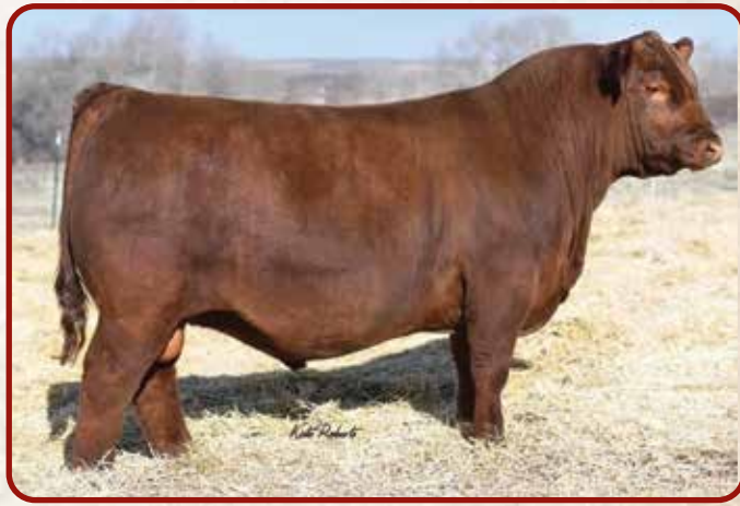
RED U2 TOWNSHIP 17G, SIRE

K138 comes from a foundation cow that the Koedams purchased from Caraway Red Angus as an open heifer and has turned into a great uddered "can't miss type" cow in the pasture. Her stats show the importance she has within the herd, posting a 106 MPPA and a 361 day Calving Interval on 8 calves. Lot 44 is a well-made, moderate framed Township son with a 714 lb. WW.