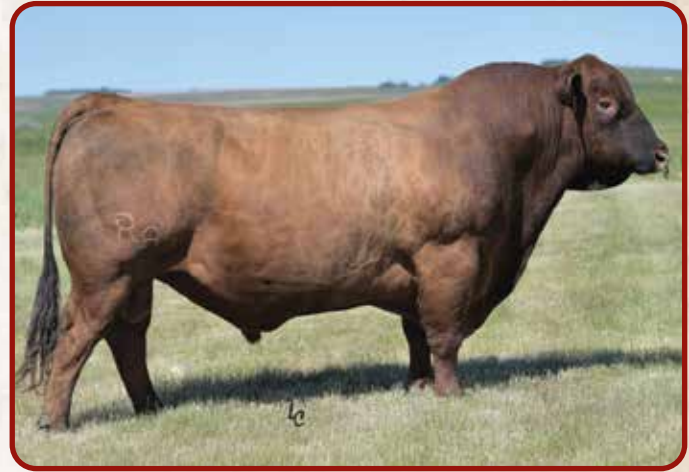
BIEBER CL ATOMIC C218, GRANDSIRE