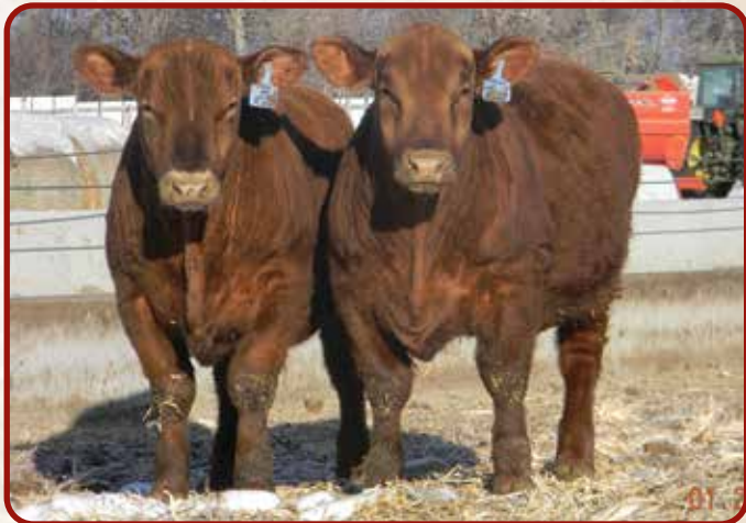
K20 & K128