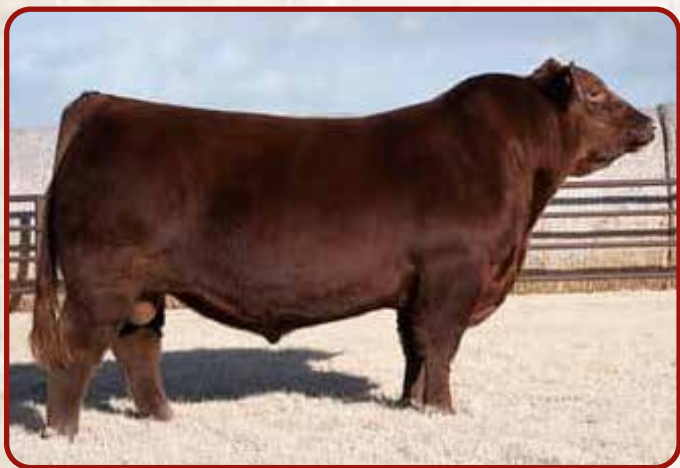
WEBR SHAMELESS 34G, SIRE

One of the hardest things to do in an auction is establish sale order. The truth of the matter is that they can't all sell first. This Up Front son with his 684 lb. WW, 1153 lb. YW and 14.7 REA scan could lead many auctions in the country. His young dam is a hard working female that posts a 106 MPPA and combines breed leading sire lines – Power Eye & Boxed Beef.